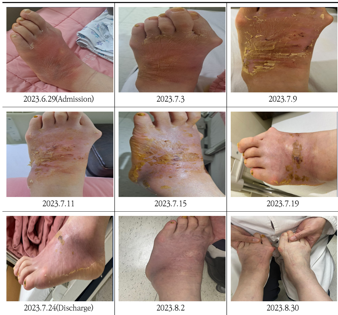
Fig. 3. Change of Skin Lesions

In the blood test conducted immediately after admission, the CRP level was elevated at 0.69mg/dL, surpassing the normal range of 0-0.50mg/dL. However, in the blood test performed five days after admission, the CRP level significantly decreased to 0.16mg/dL. Looking at the complete blood cell count results, during the early hospitalization period, the monocyte level